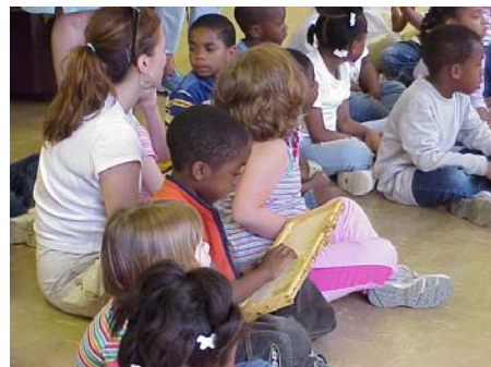
A boy with a honeybee frame