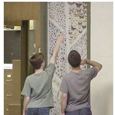
Boys with MS insects