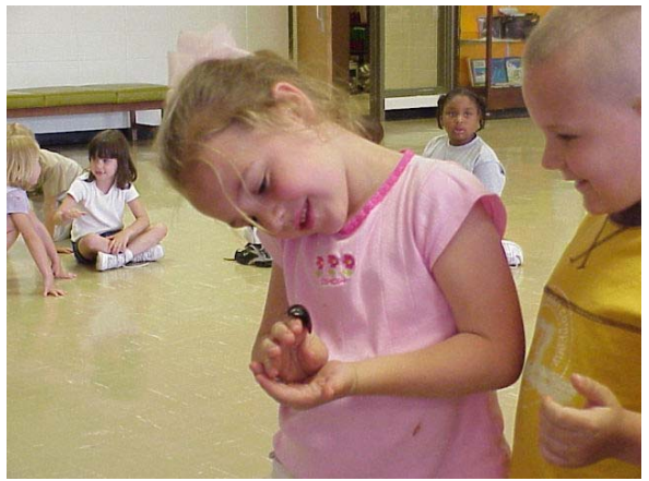
A girl with Randy the Roach. “It tickles me ...”