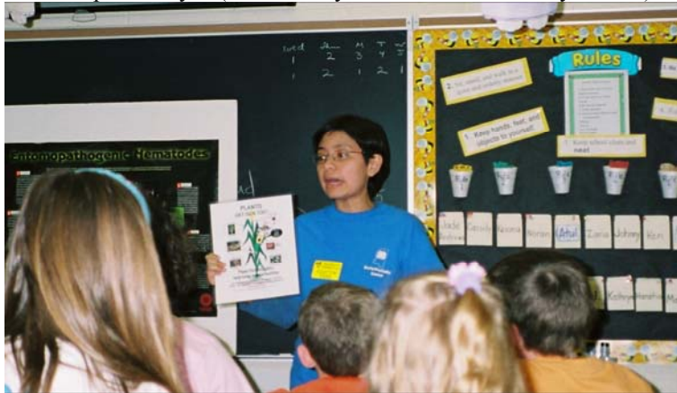
“Why these tomatoes look ugly? Like humans, plants can get sick too!!”